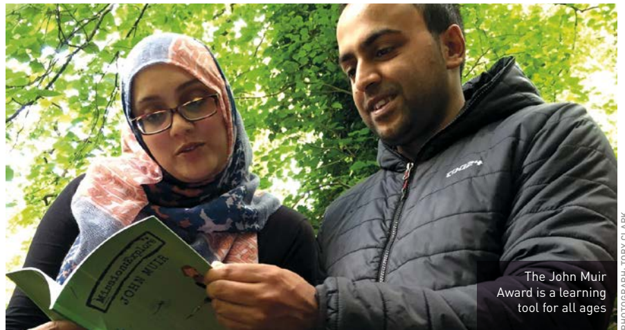
The John Muir Award is a learning tool for all ages