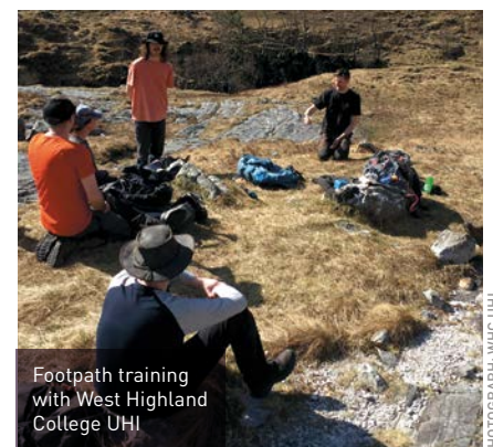
Footpath training with West Highland College UHI

Glen Nevis, by Cooper Spence P2/3, Inverloch Primary School