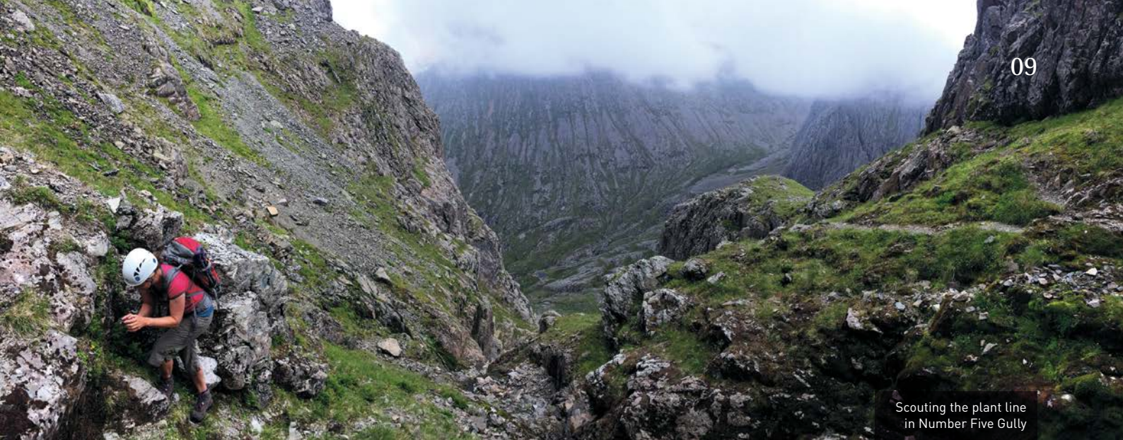
Scouting the plant line in Number Five Gully