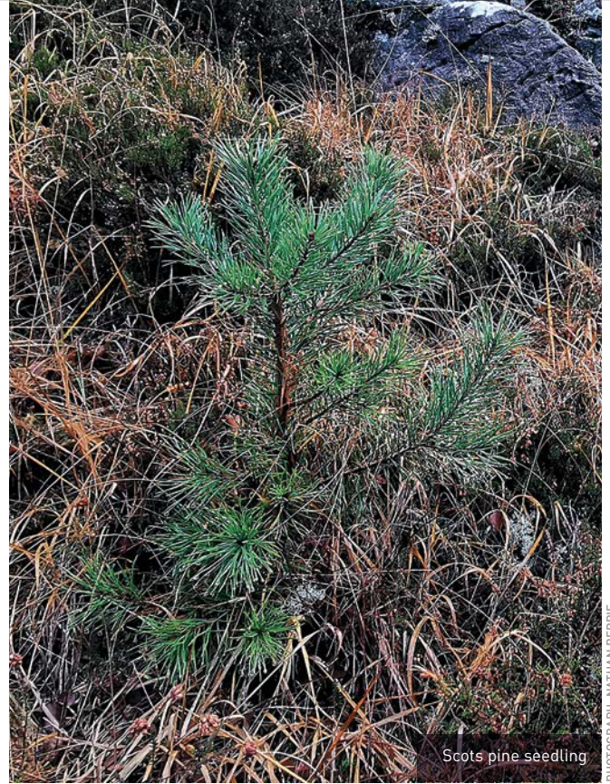
Scots pine seedling

We believe this remnant woodland is special and should be restored through natural regeneration. Doing so serves two key purposes that are more important now than ever: expanded areas of native woodland boost biodiversity by creating habitat for a range of native species, while they also help tackle the climate crisis by soaking up carbon and storing it away for centuries.