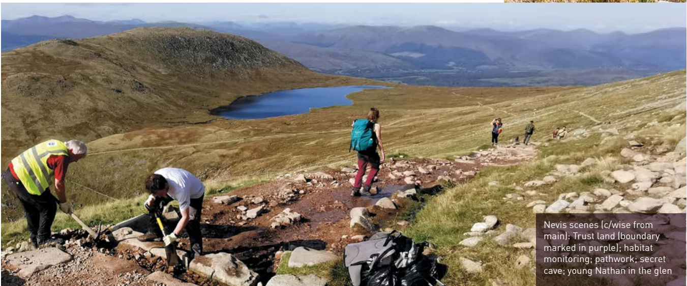
Nevis scenes [c/wise from main]: Trust land (boundary marked in purple); habitat monitoring; pathwork; secret cave; young Nathan in the glen