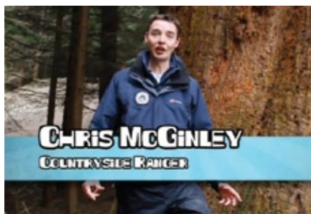
South Lanarkshire TV

"No matter how often you visit your wild place and think you know it, there is always something new to discover, almost as if I you're discovering it for a first time."