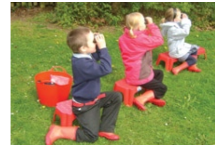
Burnfoot Community School