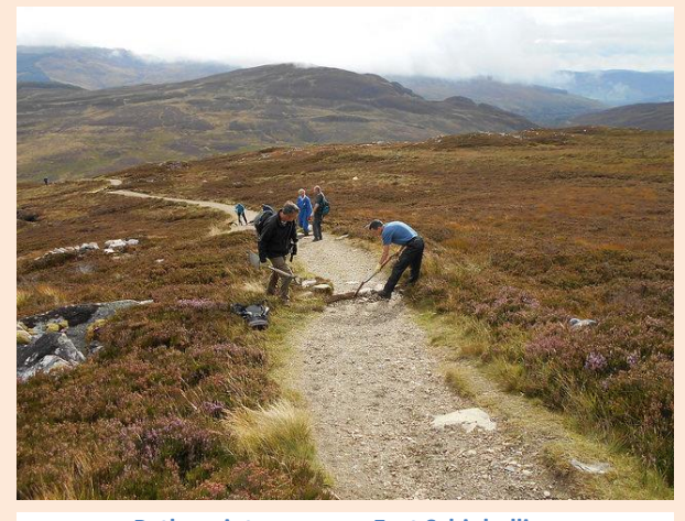
Path maintenance on East Schiehallion

the Knoydart Forest Trust to continue with the ongoing rhododendron control around the village.