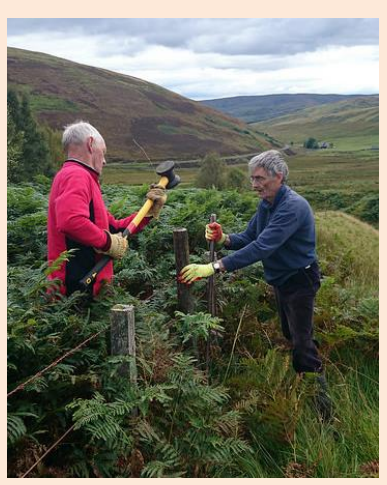
Repairing fences at Glenlude