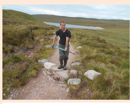
Path maintenance at Sandwood

All the photos in this report are taken from the flickr sites where you can see credits for photographers and descriptions of where they were taken.