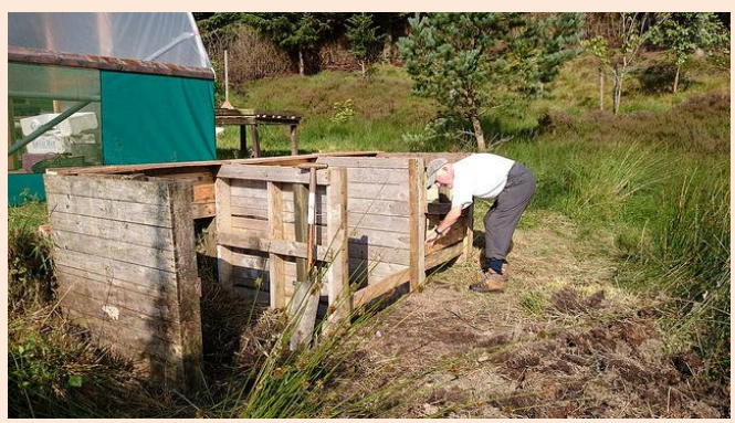
Building composting bins at Glenlude