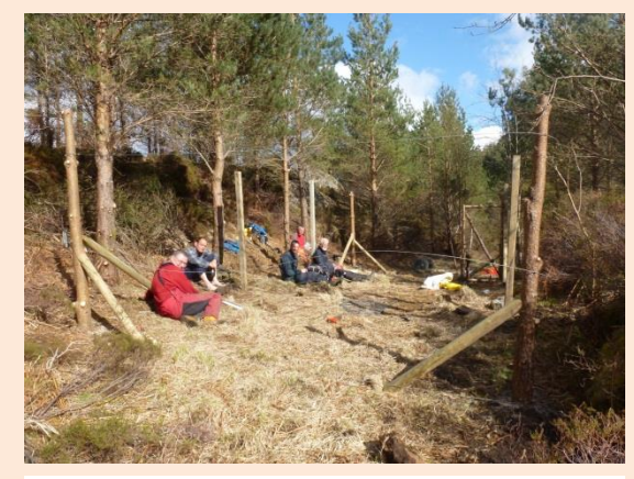
Building a tree nursery on Li & Coire Dhorrcail