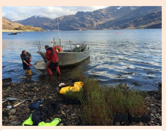
Loading trees to plant at Li & Coire Dhorrcail

During two separate weeks in the Western Isles we were able to help push forward an exciting experiment in deer management by the North Harris Trust . Partially funded by a conservation grant from the John Muir Trust a 3km long electric deer fence in a double line only at normal stock fence height is using natural boundaries to enclose over 1,800 Ha of ground to the west of Tarbert. Within this area deer numbers will be controlled to allow natural regeneration of the remnants of native woodland. Volunteers constructed over 2km of the