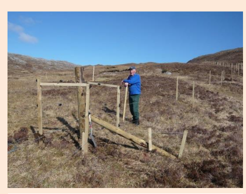
The deer fence takes shape on North Harris