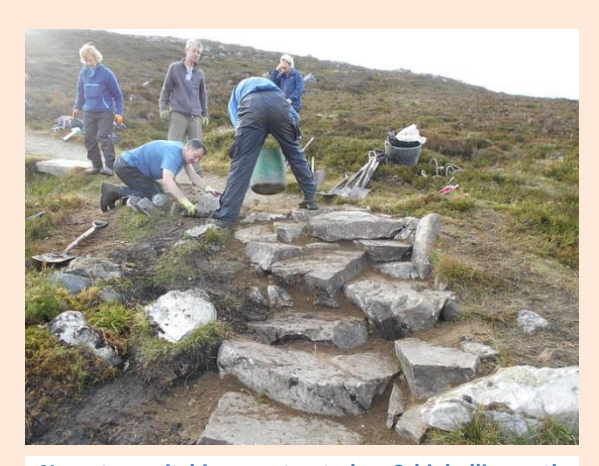
New stone pitching constructed on Schiehallion path