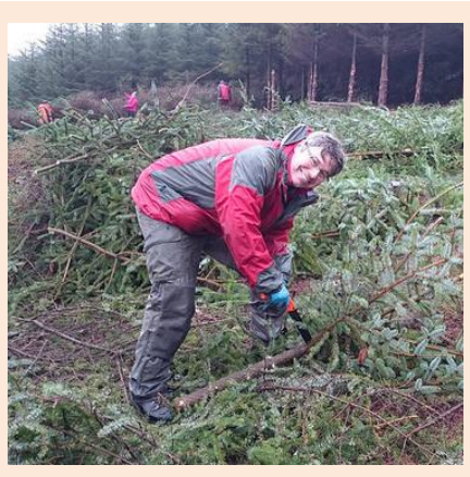
Building brash hedge at Glenlude