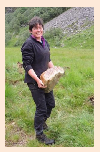
Path work in Glen Nevis

Trust properties, but visits were also made to partners and like-minded properties.