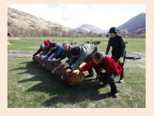
Building benching on Long Beach campsite

Sandwood and Quinag were both visited twice during the year. The ongoing tasks of path repair and beach cleaning were the main features of both Sandwood visits and the car park at Blairmore got some attention with the toilets repainted and one of the benches partially rebuilt. At Quinag there has been a fair amount of work on the paths by local contractors so volunteers only had a small amount of maintenance to carry out.