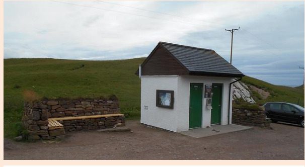
Repainted toilet and new woodwork at Sandwood car park

volunteers spent a couple of days at Ennerdale being shown around the valley and then helping local volunteers and staff from other agencies in a range of tasks including woodland management and flood prevention to assist with the conservation of fresh water pearl mussels.