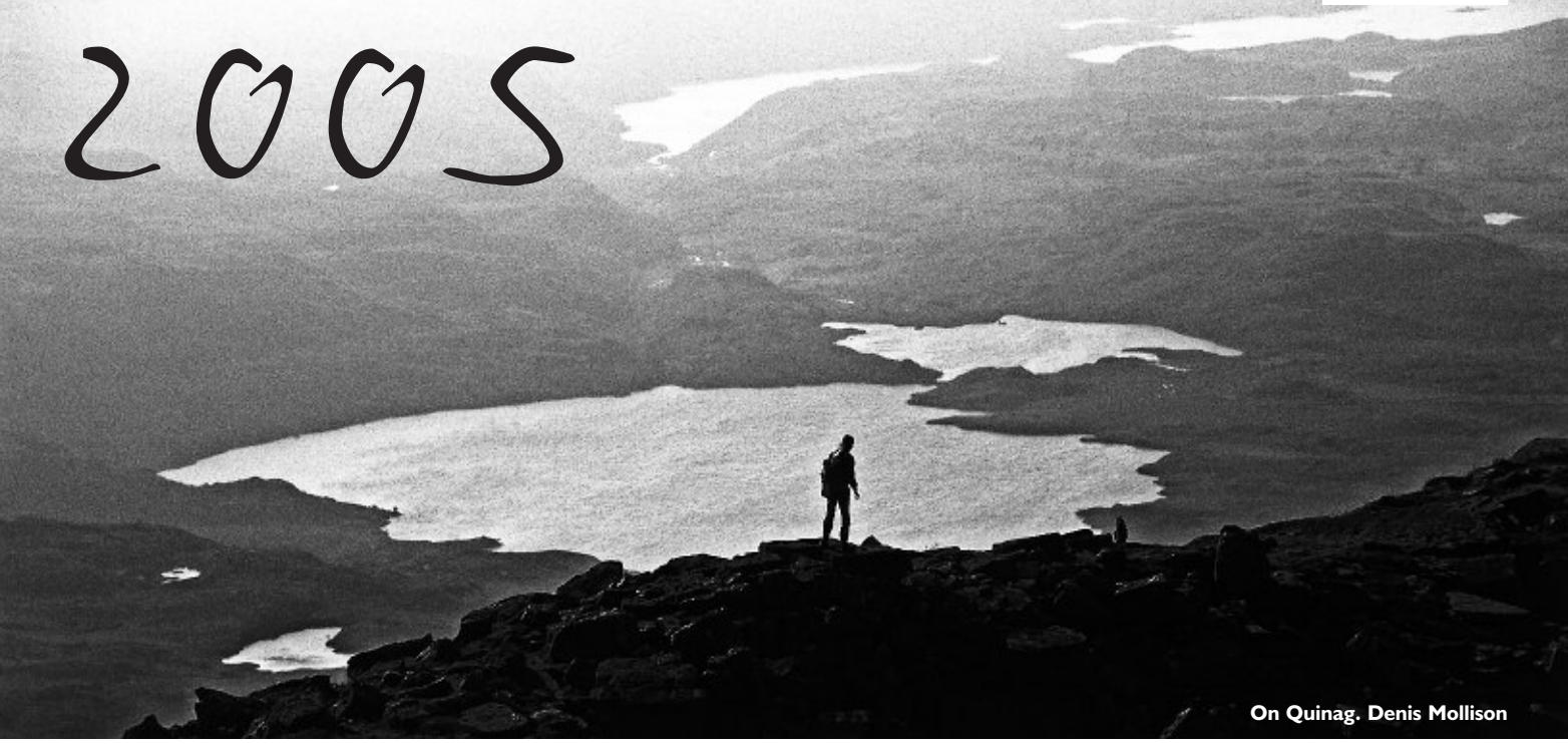
John Muir Trust + Wild Land + Wildlife + Education + Adventure