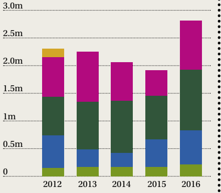
Fig 2: Charitable expenditure

Income from charitable activities Other income (including fundraising, investment income, merchandise and rents)