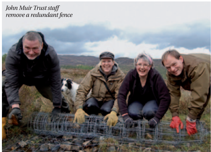
John Muir Trust staff remove a redundant fence

Staff should be knowledgeable and trained in all aspects of wild land management, having regard for all aspects of wild land management as well as sustainable principles. Adequate Health & Safety training is