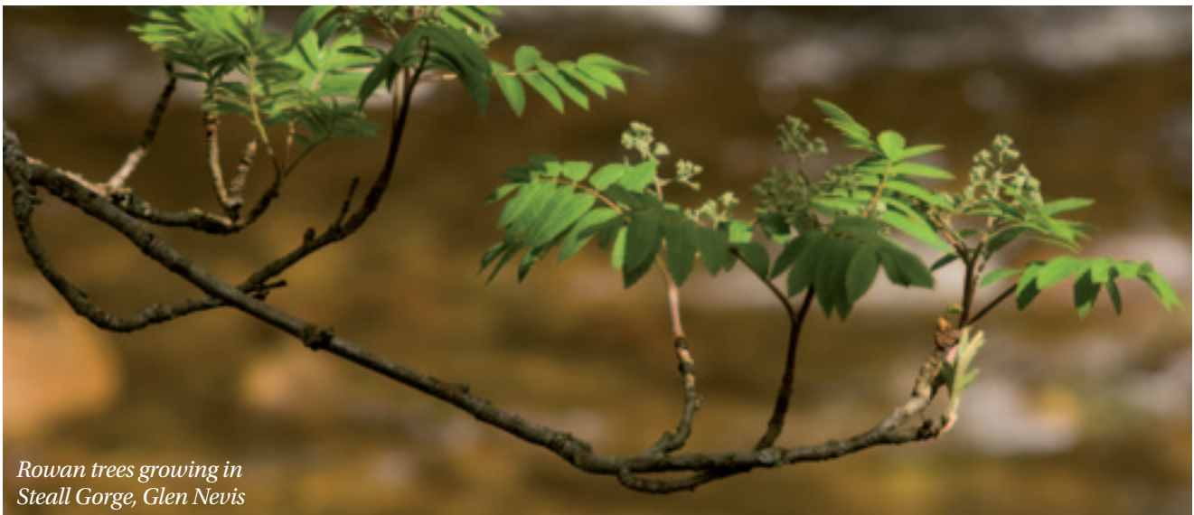
Rowan trees growing in Steall Gorge, Glen Nevis