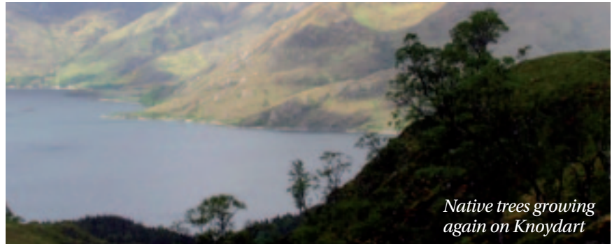
Native trees growing again on Knoydart

A programme of monitoring work should be established to