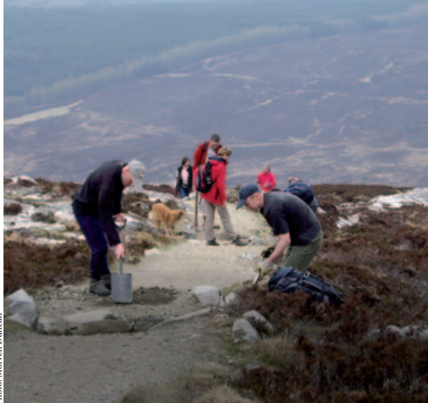
Path maintenance on Schiehallion

The visual impact of the path should be a primary consideration and paths should be built using local materials. Designs should be as simple as possible and maintain natural variations in terms of width and materials. ■