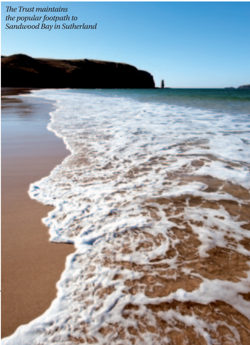
The Trust maintains the popular footpath to Sandwood Bay in Sutherland

Where educational visits are likely to take place, land managers should enhance the experience of those taking part – for example, by providing local knowledge. ■