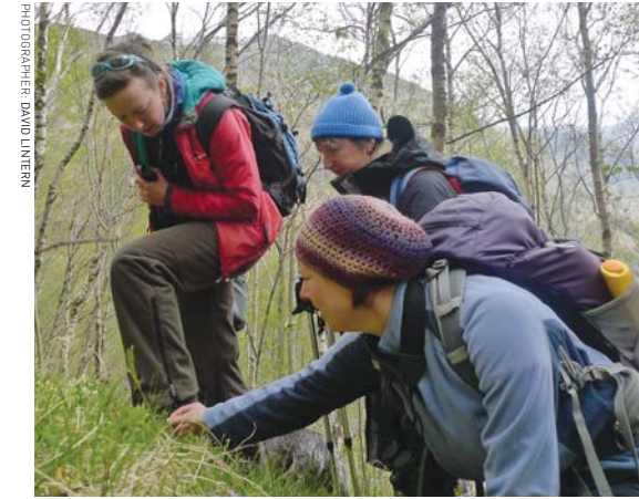
Nevis Wild Day participants get up close with local flora in Steall Gorge

There are still places available on the following Wild Days: