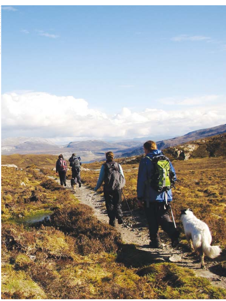
Walkers enjoy the built path at the base of Quinag