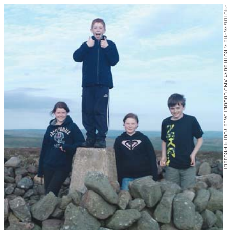
Youngsters take a break during Award work in the Cheviots