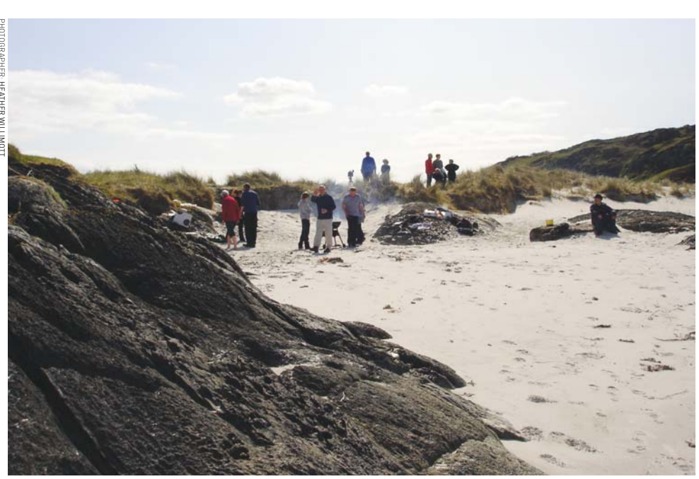
Not a bad spot for a barbecue – relaxing on a beach at the north end of Gigha