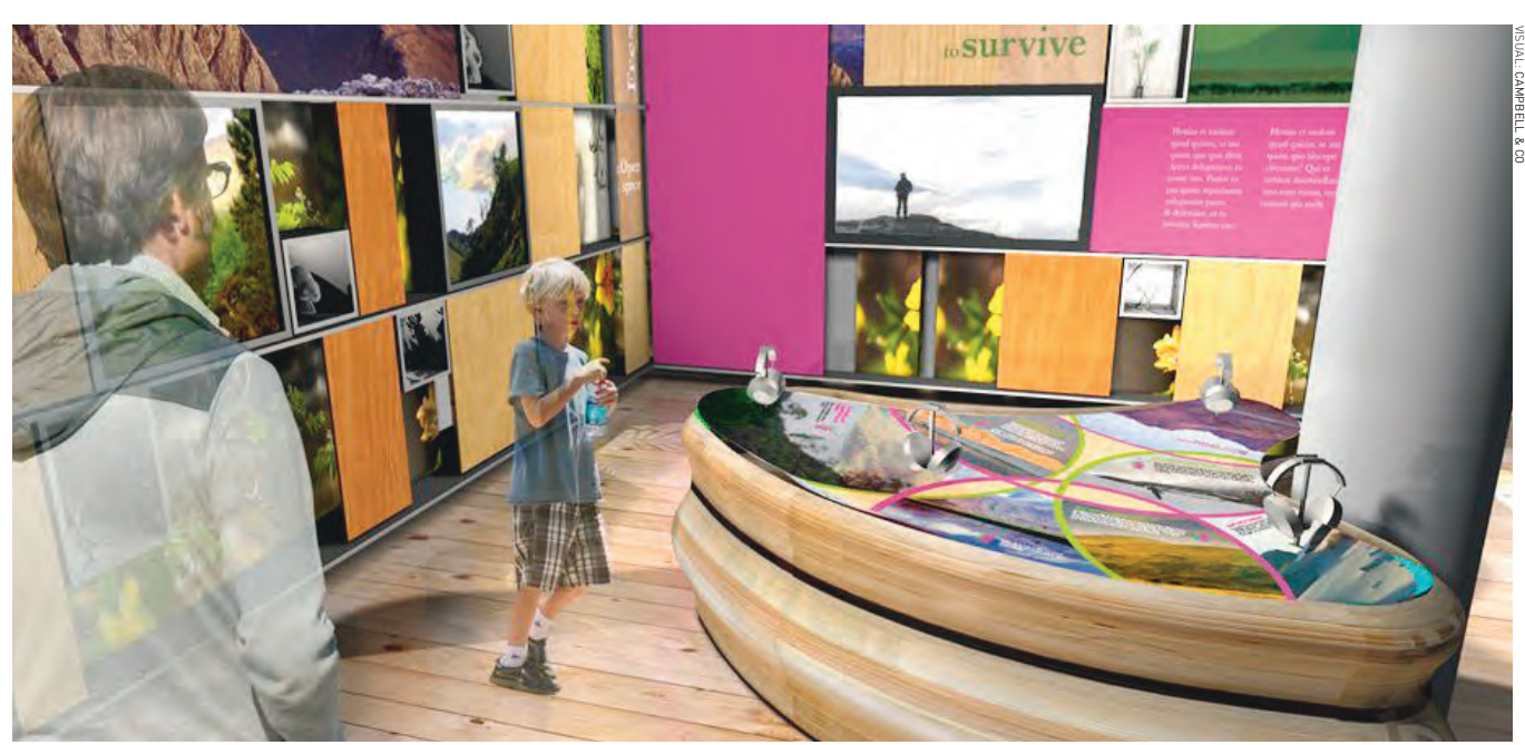
An artist's impression of the Trust's new Wild Space exhibition area

If everything continues to go to plan, we look forward to welcoming you to our Wild Space by Easter 2013.