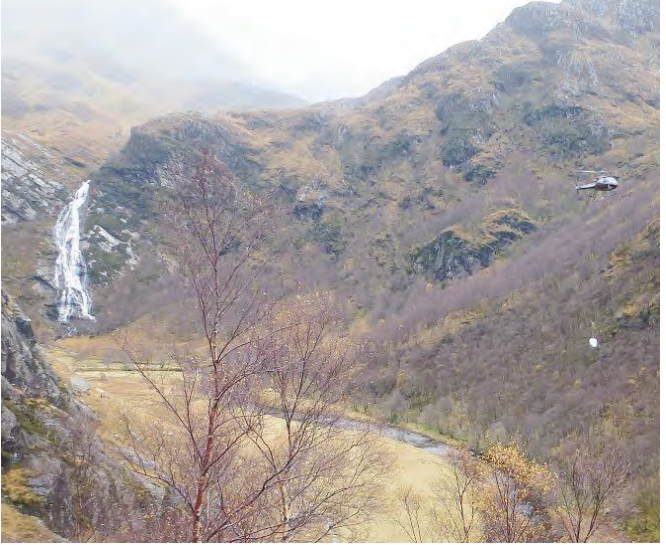
The helicopter had to negotiate some extremely tricky terrain (top); working amidst dramatic scenery (below)