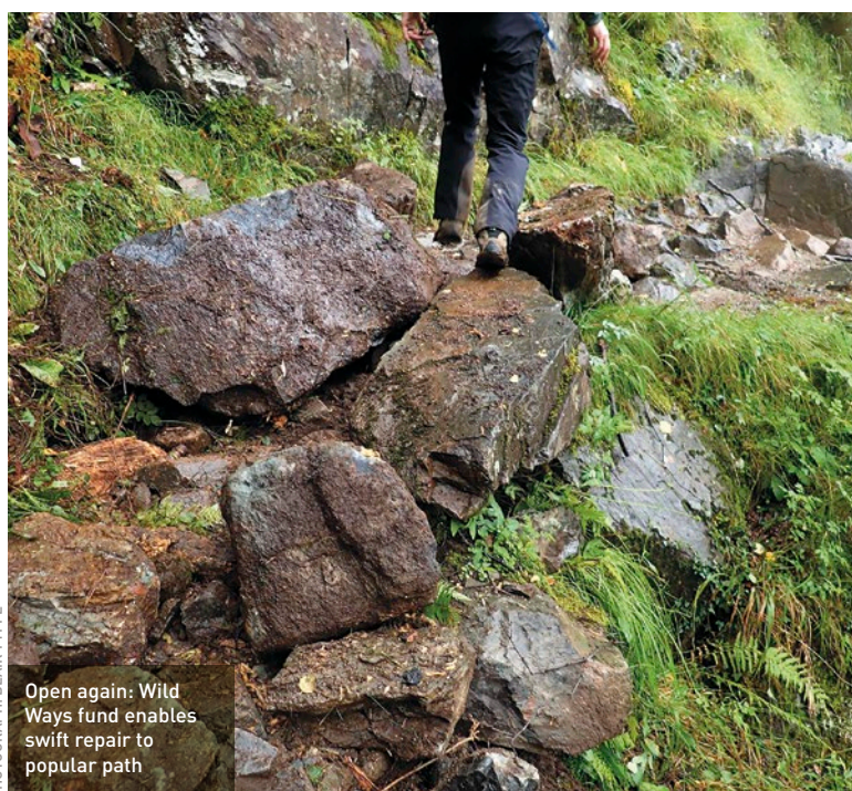
Open again: Wild Ways fund enables swift repair to popular path