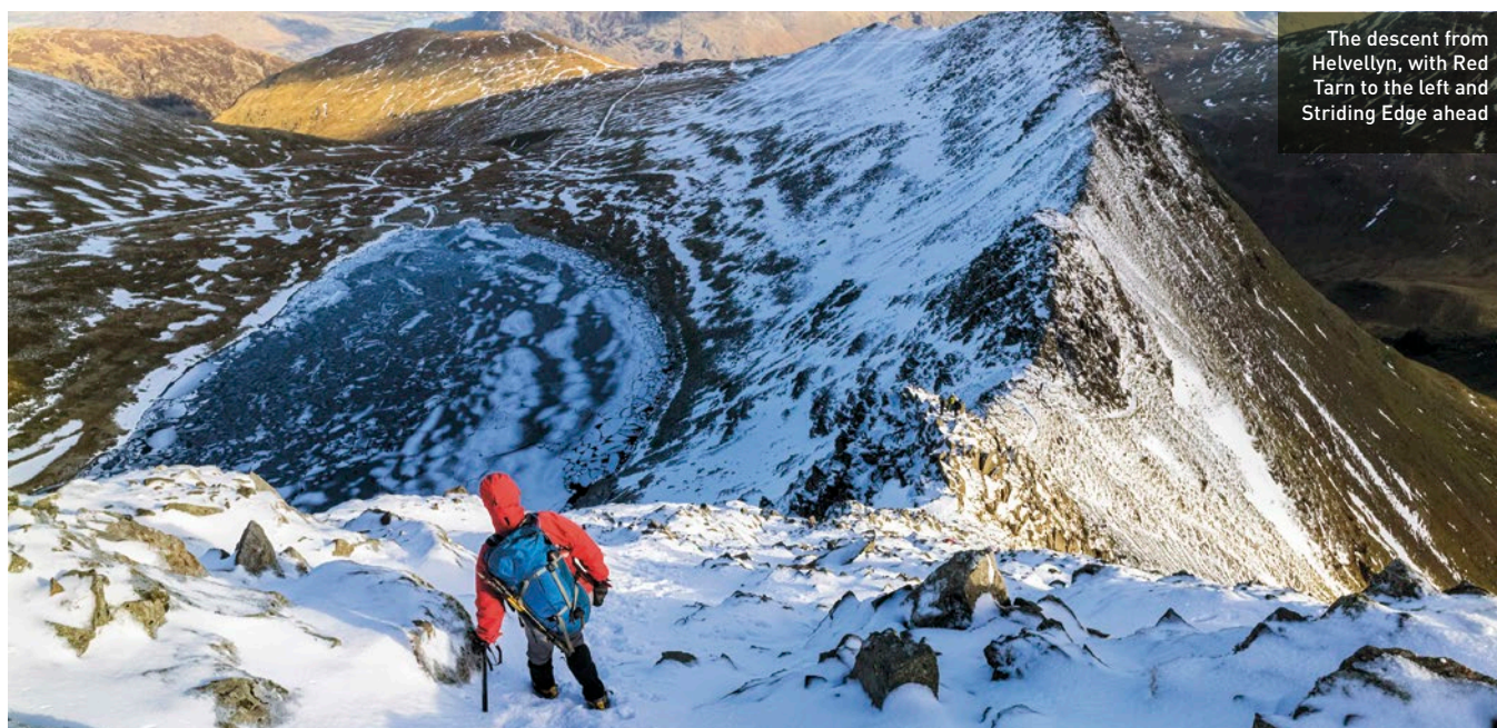
The descent from Helvellyn, with Red Tarn to the left and Striding Edge ahead