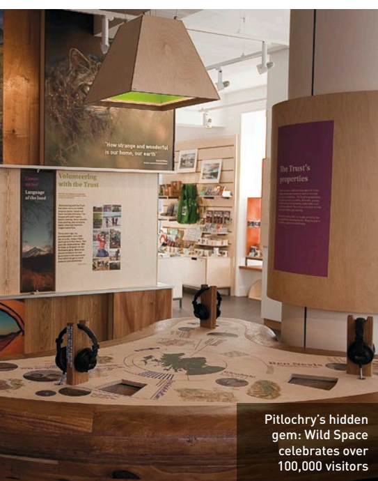
Pitlochry's hidden gem: Wild Space celebrates over 100,000 visitors

Read more about the evening and watch the evocative film Wilderness at johnmuirtrust.org/spiritofjohnmuir