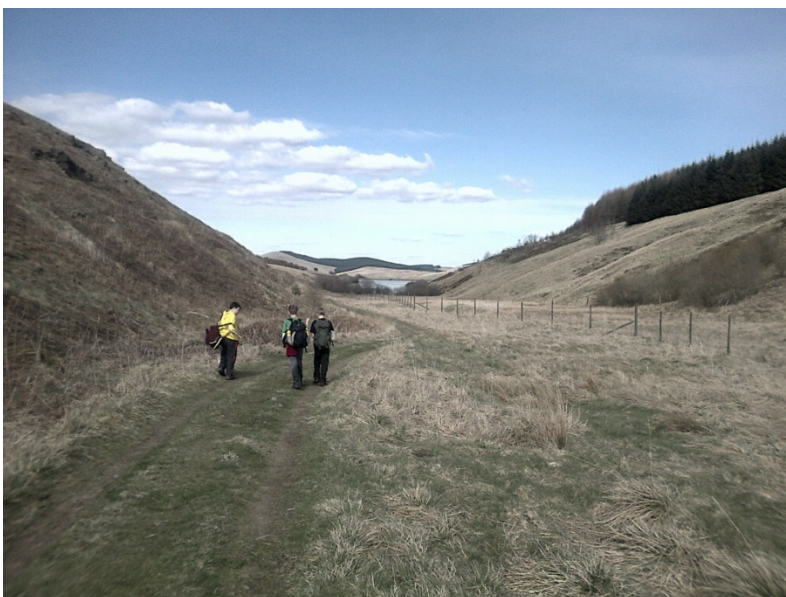
Off into the wilderness we go! Glendevon, Perth & Kinross, April 2015

“He loved participating in the John Muir Award and each night of the week-long course would come home and excitedly tell me all he had got up to and was very keen to go back the next day. Doing the Award had a very positive impact on my son and I could see this for myself after attending the sharing event with parents last night. I was very impressed how he confidently built and lit a fire and boiled water to make a cup of tea, whilst being aware of what needed to be done safely. The group shared their experiences with the parents and it was great to hear how the whole group came together to build a bridge as part of working as a team. We watched a video of them following instructions to build owl boxes. They had to measure out the dimensions on wood, saw out the pieces and assemble the boxes, so a great educational experience as well. My son made new friends, loved camping out, learning how to cook outdoors, learning more about nature and conservation skills. I saw a different side to my son on the sharing evening, he engaged and communicated with the other children and generally had a ball. It was great to see him and all the other children having such fun and showing off some of the skills they learnt on their John Muir Award. He had a really great sense of achievement and this has had a positive effect on his self-esteem.”