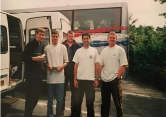
Handa Island (above) and the long drive from Grangemouth (2000)