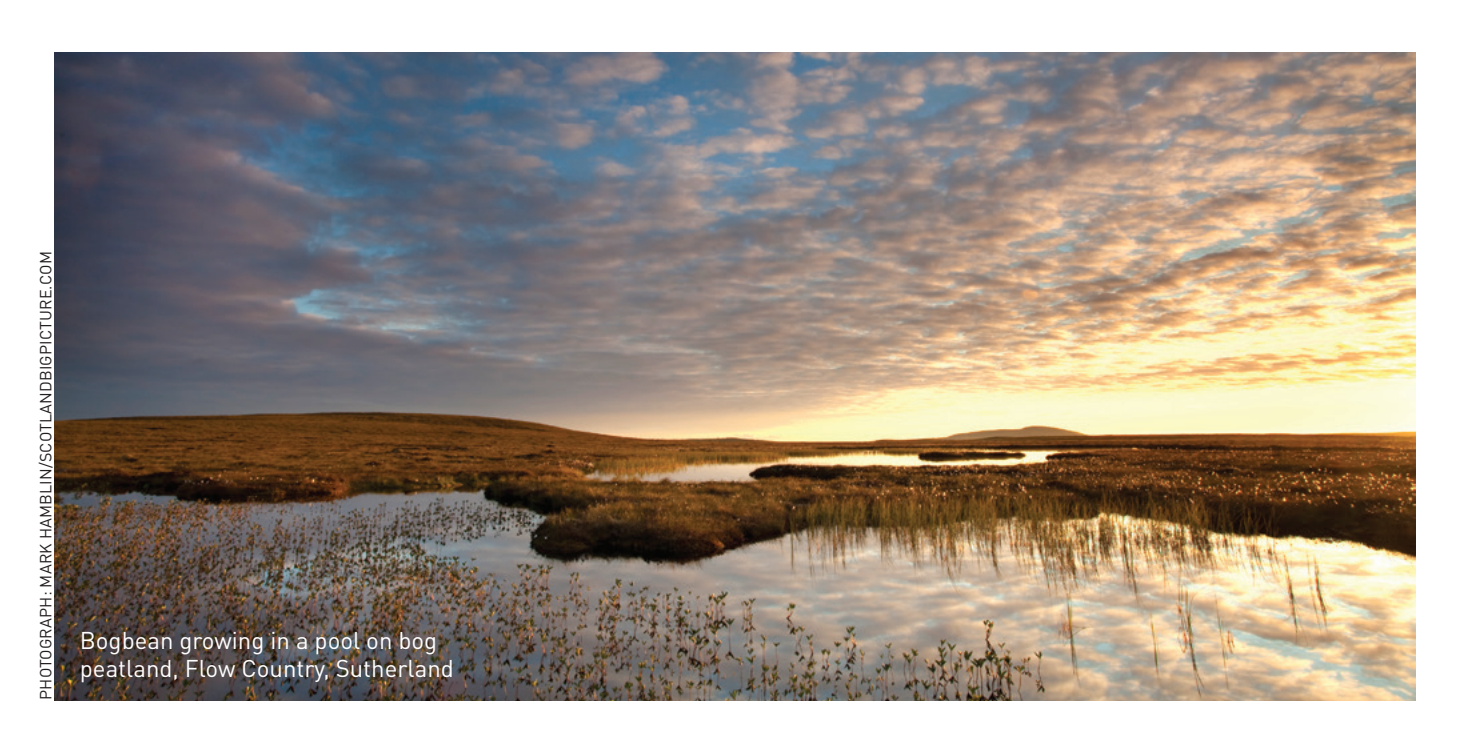
"The UK's net-zero target will not be met without changes in how we use our land. Those changes must start now." – Committee on Climate Change, January 2020

We believe that a collective effort along these lines, involving the Scottish Government, the Scottish Land Commission, Community Land Scotland, Forestry and Land Scotland, the Just Transition Commission, environmental NGOs, and individual landowners, could bring new hope and optimism to rural Scotland; drive forward the repeopling of our glens; and become an international showcase contributing to progressive global change in land use and management.