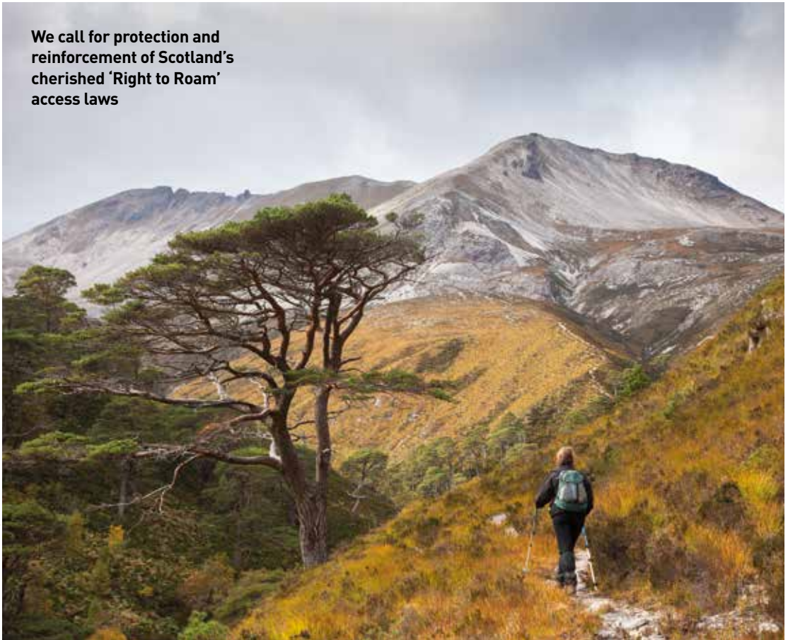
PHOTO: BEINN EIGHE, TORRIDON

We call for protection and reinforcement of Scotland's cherished 'Right to Roam' access laws