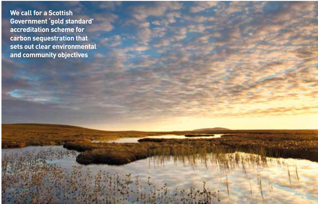
PHOTO: THE FLOW COUNTRY

We call for a Scottish Government 'gold standard' accreditation scheme for carbon sequestration that sets out clear environmental and community objectives