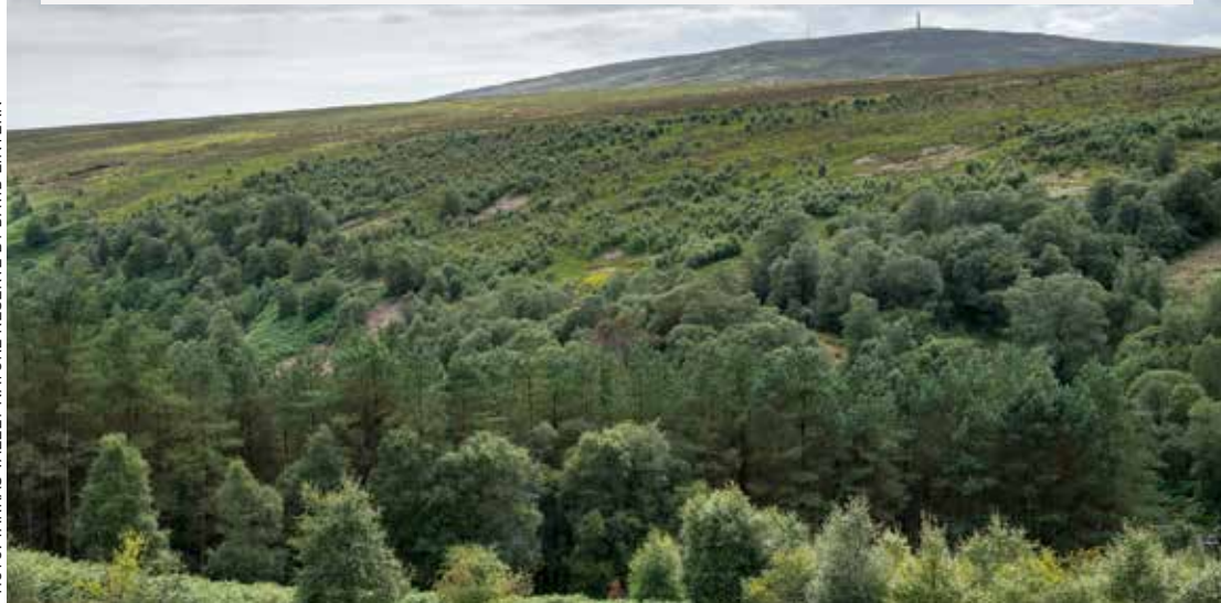
PHOTO: TARRAS VALLEY NATURE RESERVE

These vast expanses of uplands, spread across 35,000 square kilometres, have low agricultural value – but high biodiversity potential. The key word here is ‘potential.’ Right now, much of that land is severely nature-depleted as a result of overgrazing, burning, draining and the historic planting of dense commercial forestry plantations.