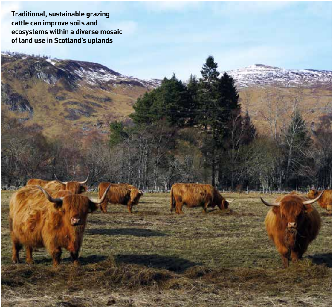
PHOTO: HIGHLAND CATTLE NEAR SCHIEHALION

Entire communities are threatened with being converted into winter ghost towns by the surging demand for short term rented holiday accommodation, tearing apart the fabric of cultural and social life.