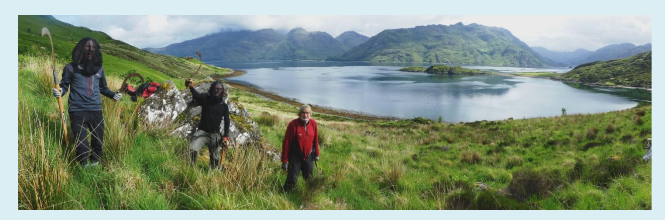
above Preparing to clear bracken around trees at Li & Coire Dhorrcail below path maintenance on East Schiehallion

The number of work days achieved in the main programme was very similar to 2016 with an average work party consisting of ten people but due to the informal way that they are run (people look after their own travel and accommodation) people do drop in and out, usually to fit in hill walks or bags!