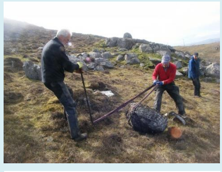
Path work on Huishinis to Cravadale path