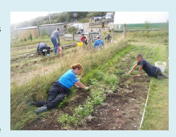
Above Weeding at the CALL (Coigach Assynt Livving Landscape) tree nursery, middle planting a brash hedge at Corrour, below hanging a gate on the Corrour brash hedge