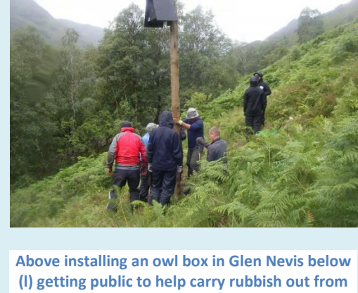
Sandwood Bay (r) drystone wall repairs on Tanera Mor

o in North Harris a day was spent fencing and landscaping around the new campervan sites that are part of the new Gateway at Huishinis