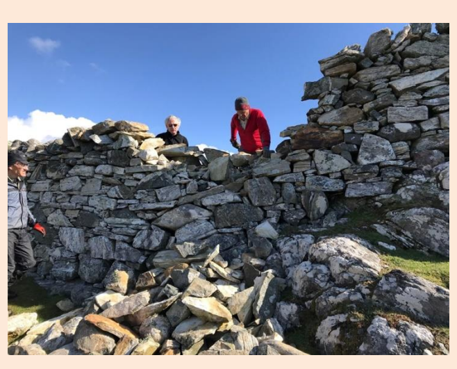
Above repairing drystone dyking on Isle Scalpay below a dyke fully repaired at Glenridding