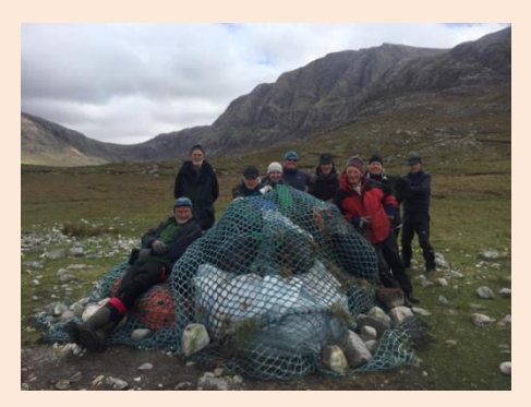
Beach rubbish collected at Traigh Mhuilean on North Harris

These events are designed to enable our members and others to: