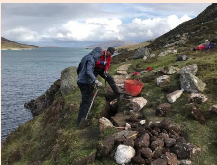
above and left Path work at Huishinis on North Harris below relaxing on the water of Loch Ossian after a days

As well as on our own properties and two on Glenridding which is now being managed by the Trust visits were made to partners and like-minded properties including the Coigach and Assynt Living Landscape (CALL) project that we are a member of, community owned estates that we have been involved with such