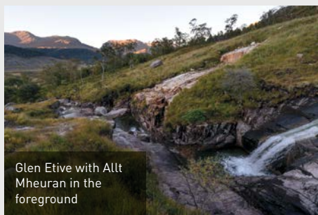
Glen Etive with Allt Mheuran in the foreground

The Trust is keeping a watchful eye as reports indicate that SEPA, Highland Council and the developer of the run of seven river hydro schemes at Glen Etive are in discussion as to whether the engineers can actually progress the work that was approved, in a way that doesn't damage the natural environment – the very thing the planning conditions were supposed to protect in the first place. The Trust objected to three of the seven developments.